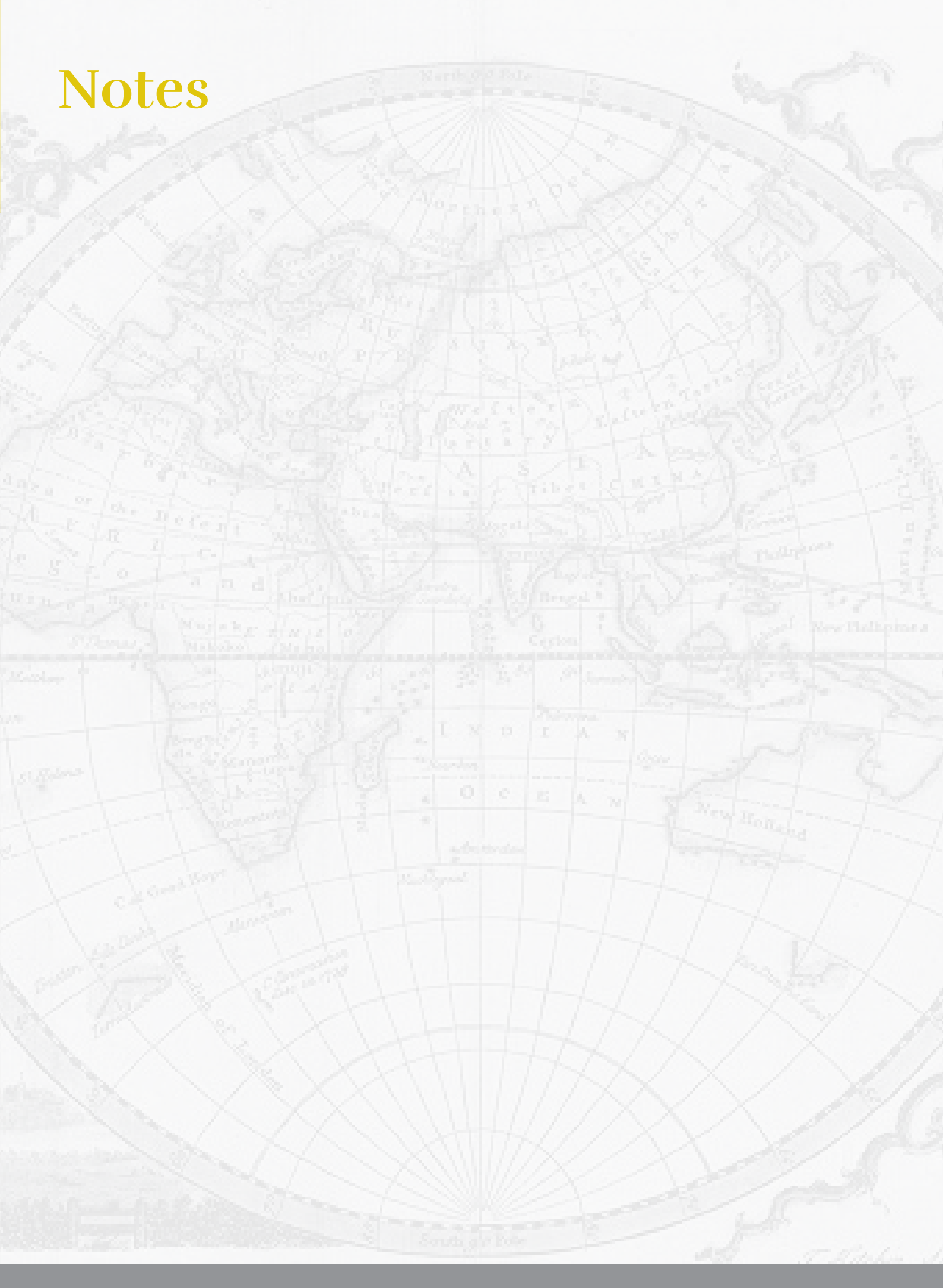
Integrity. Trust. Connection. The Ton.